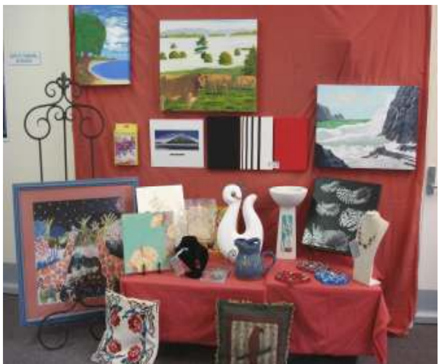
The donated pieces for the Art Auction on display in the office foyer