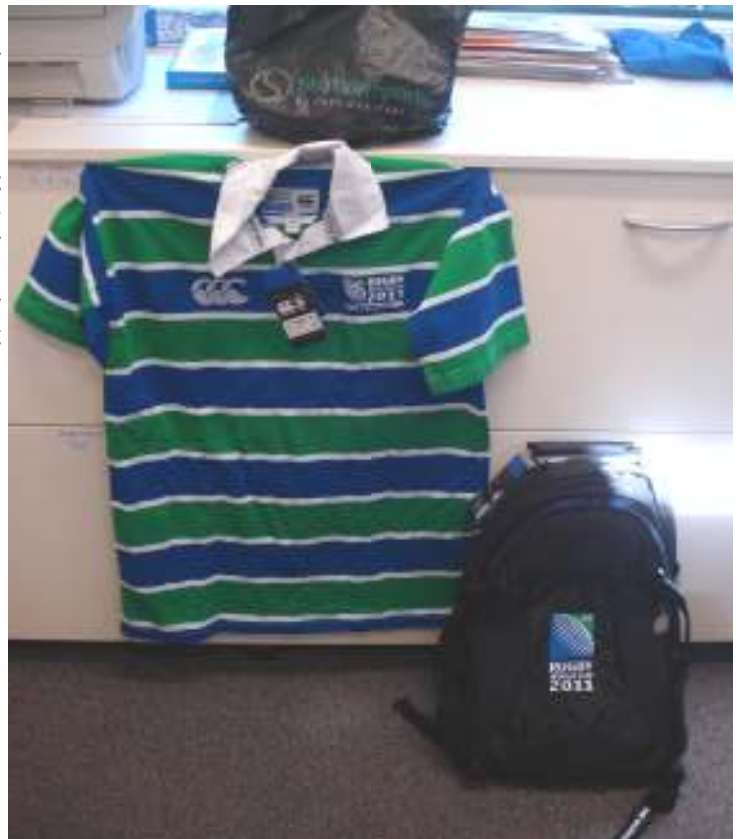
Rugby jersey and back pack that are 1st and 2nd prize in the Rm 1 & 2 raffle.